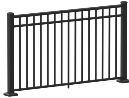
200 Series Picket 3-Line